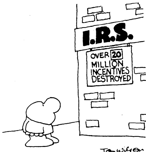
Cartoons from: The Southern Libertar- ian Messenger September 1985

"Politicians see the light when they feel the heat."