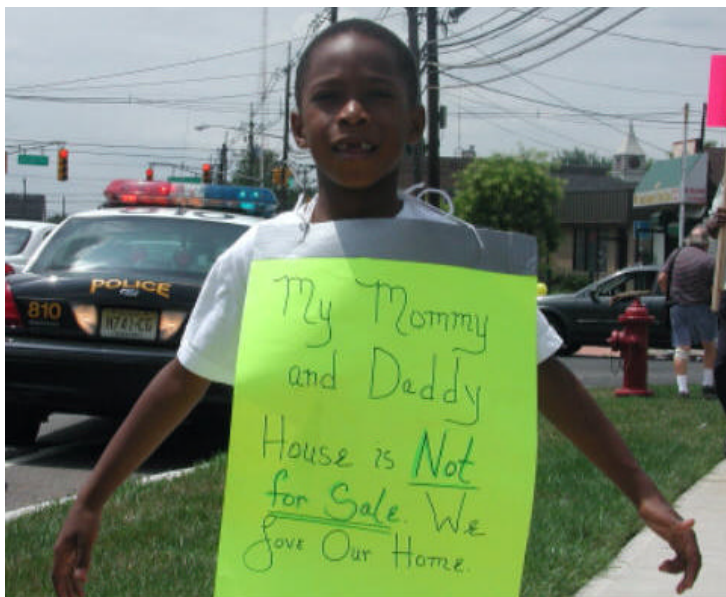
Local child wishes to remain in his home.