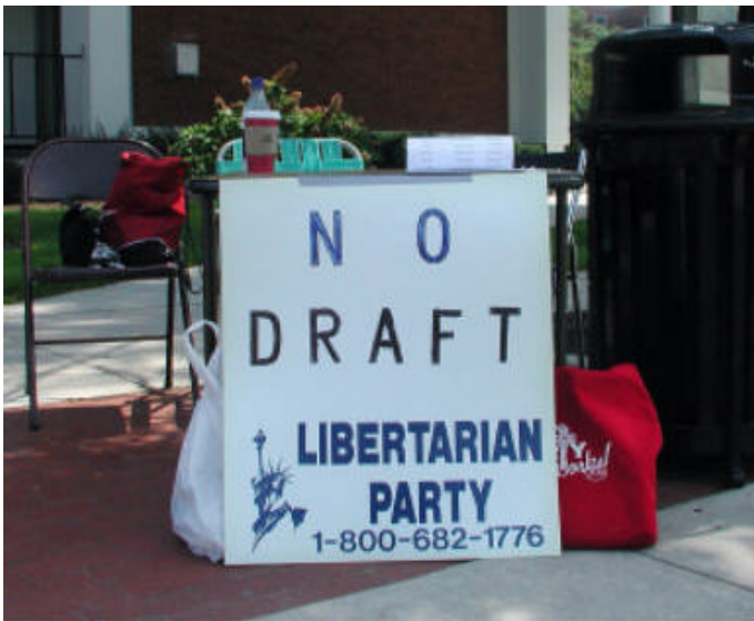
An attention-getting sign for the booth at Rutgers.