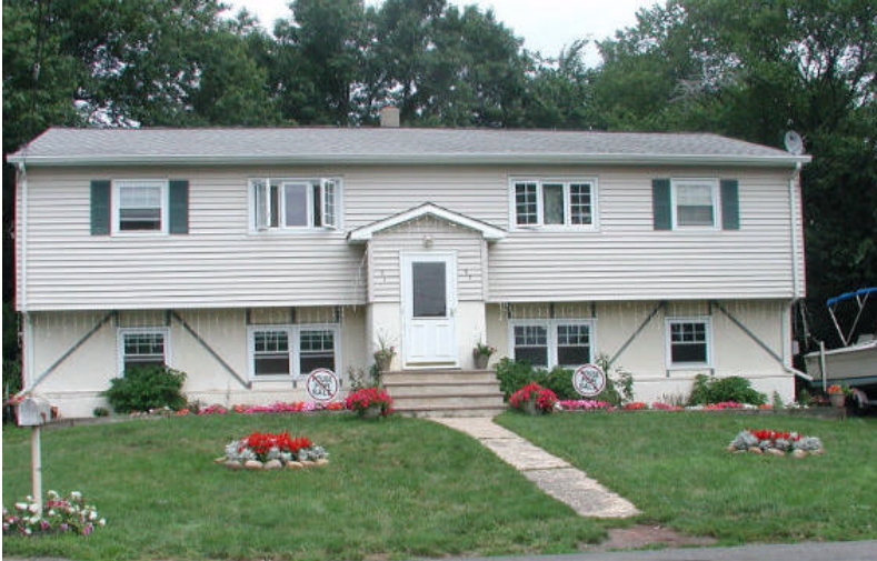
One of the homes in the so-called “urban slum” slated for condemnation to make way for the new Pathmark.